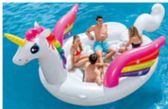
Giant Unicorn Lounge (4-6 seater)

For Lux 1 (Mini) - $40/charter For Lux 2 (Standard) - $60/charter