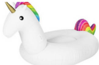
Giant Unicorn Float (1 Seater) $20 /charter