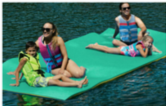
Floating Water Mat

For Lux 1 (3.5m*1.5m) - $40/charter For Lux 2 (5.5m*1.83m) - $60/charter