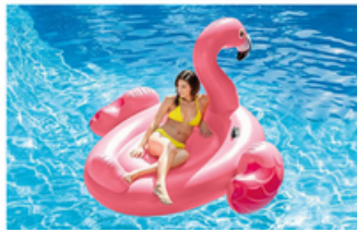
Pink Flamingo (1 seater) $20 /charter