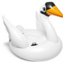
White Swan (1 seater) $20 /charter