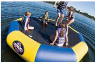
Inflatable Water Trampoline

For Lux 1 (3.5m*1.5m) - $40/charter For Lux 2 (5.5m*1.83m) - $60/charter