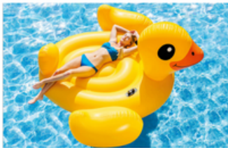
Yellow Rubber Ducky (1 Seater) $20 /charter