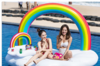
Rainbow Cloud Float $20 /charter (Mini cloud not included)